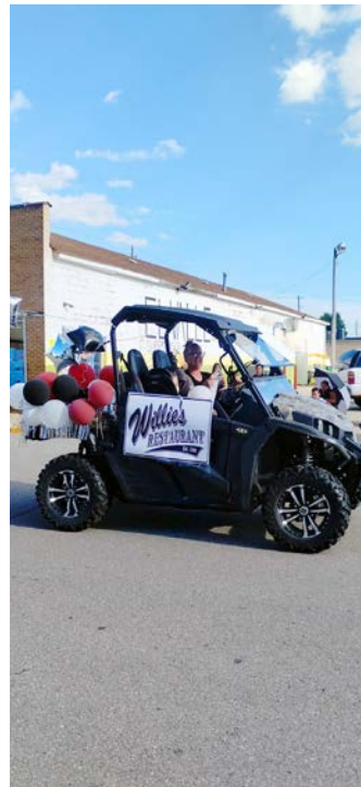
The Willie's crew tossing out candy during the parade.