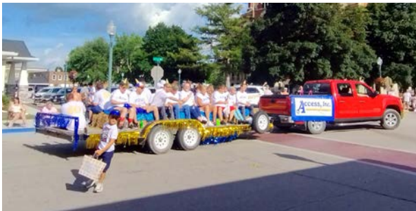
The Access Inc. float passing the courthouse during the parade.