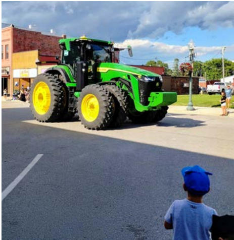
A tractor making its way through downtown for the annual fair parade.