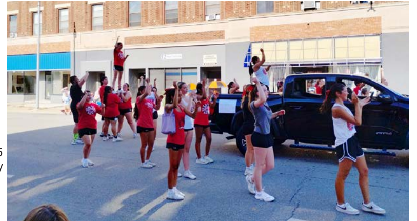
The H-D-CAL cheerleading squad puts on a performance during the 2025 Franklin County Fair Parade on Tuesday, July 8.