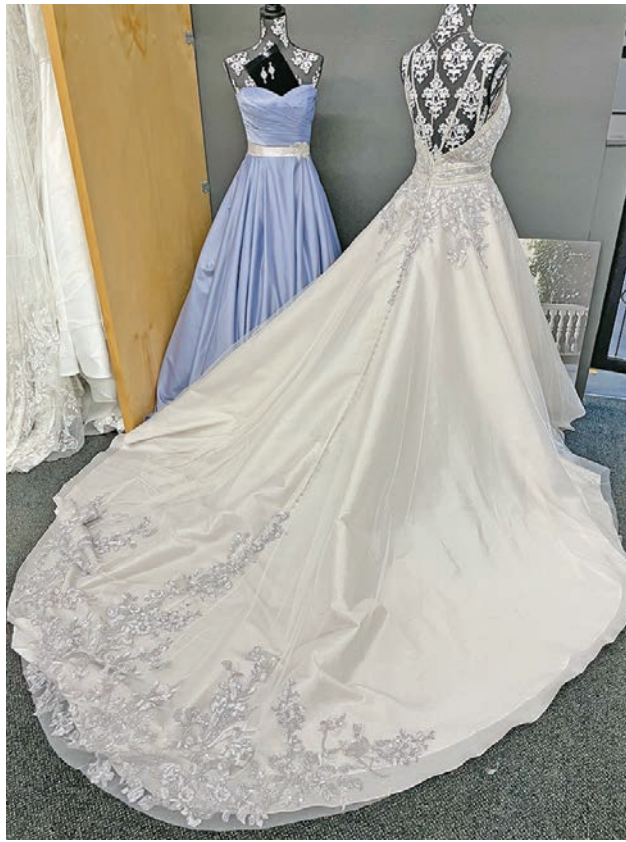
Bliss Bridal offers a stunning collection of gowns and formal wear for every occasion.

"We sell everything right off the rack so you don't have to worry about shipping or anything like that, you can