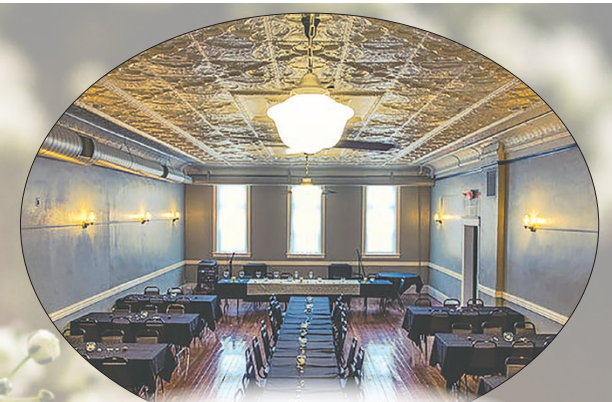
Ballroom amenities include: bar with up to 4 taps; bartender service; PA/sound system; stage; adjacent kitchen; chair lift for people with disabilities.