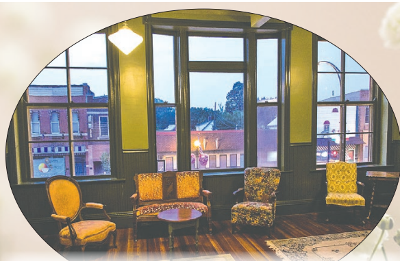
The Bee Hive Ballroom is made up of the Ballroom, Speakeasy Lounge, Green Room, and Catering Kitchen

835 Central Avenue Northwood, Iowa contact: manager@worthbrewing.com